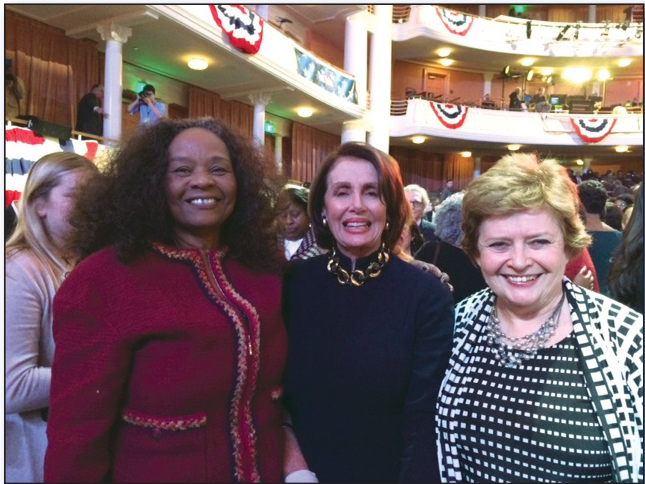
Broadcast on NBC