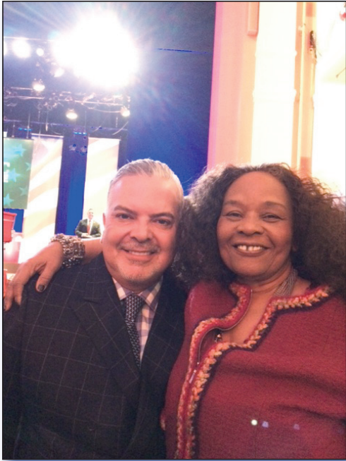
January 17, 2016 in South Carolina