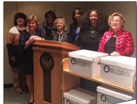
Past Presidents at the Library of Congress presentation.