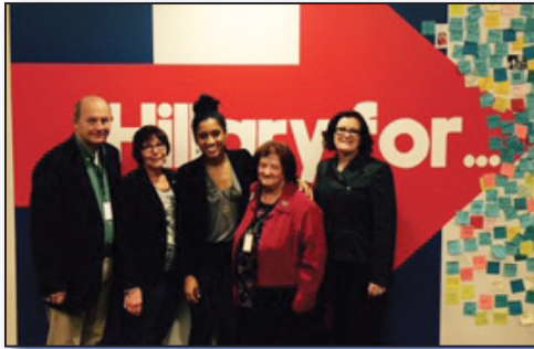
At the Hillary for President Headquarters