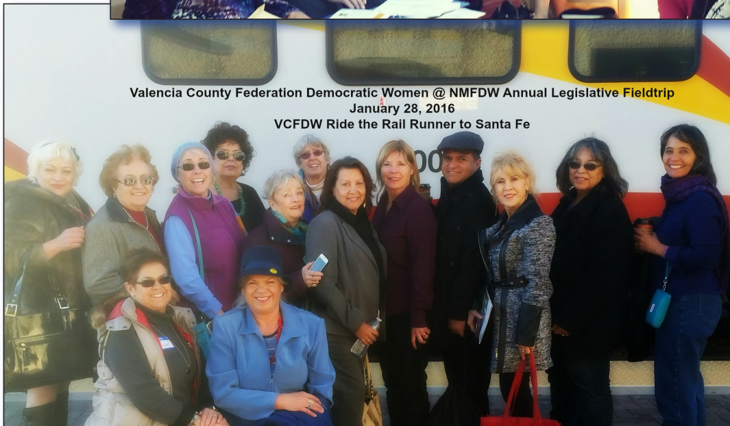
Valencia County Federation Democratic Women @ NMFDW Annual Legislative Fieldtrip January 28, 2016 VCFDW Ride the Rail Runner to Santa Fe