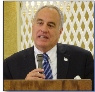
Tom DiNapoli, NYS Comptroller, addresses the NYSFDW at their annual meeting, October 10, 2015.