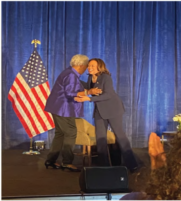
Vice President Kamala Harris in a one-on-one session with former DNC Chair and Political Strategist Donna Brazile at the Women's Caucus Meeting.