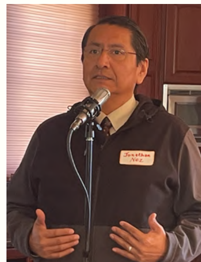
Johnathan Nez, AZ CD2 Candidate - D