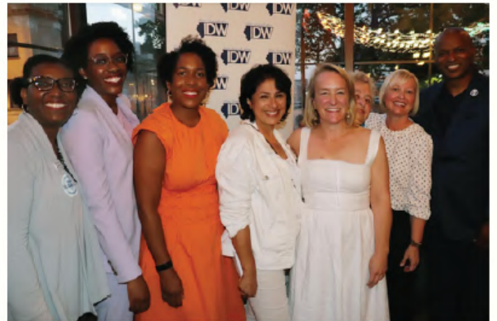
Congresswoman Lauren Underwood (left), and Congresswoman Nikki Budzinski (right) at IDW Bash Before the Brunch