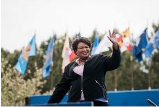
Norfolk "Souls to the Polls" Rally with Stacey Abrams, Congressman Bobby Scott and Terry McAuliffe, October 17, 2021.

November 2nd, Election Day is right around the corner and voting has already begun in Virginia! Sunday Voting is happening for this first time in Virginia's history. It's important that we show up and show out with our friends, family, and community. On Sunday, October 17 th a "Souls to the Polls" rally was held in Virginia with special guests Stacey Abrams and Mayor Keisha Lance Bottoms joining us for signature events in Norfolk, Richmond, and Fairfax.