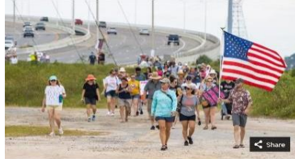
Dozens of area residents participated in a march over the Hathaway Bridge in Panama City Saturday in support of national Women's March Day.