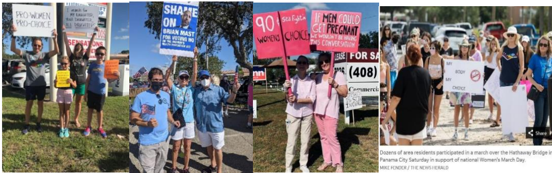
Dozens of area residents participated in a march over the Hathaway Bridge in Panama City Saturday in support of national Women's March Day.