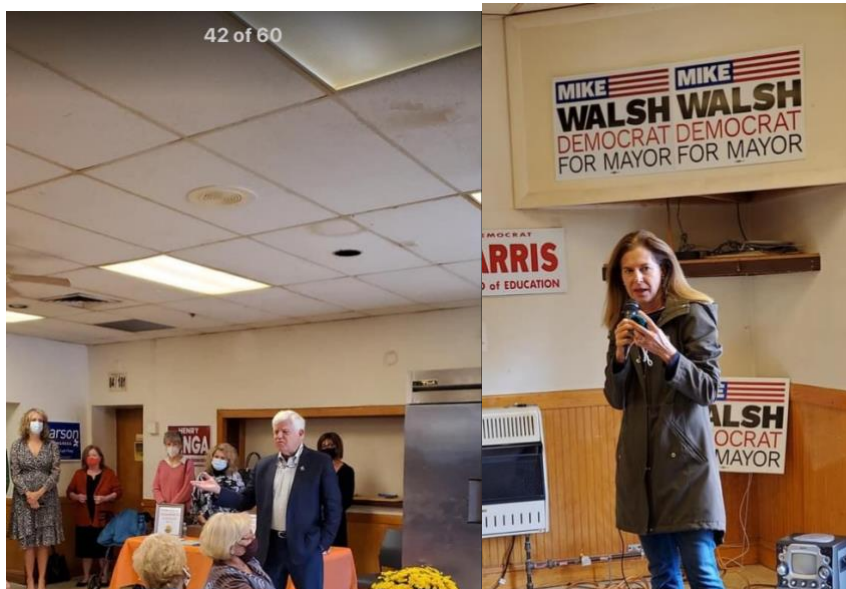
Congressman John Larson