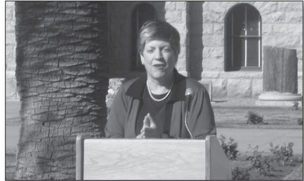
Arizona Governor Napolitano welcomed everyone at the Arizona State Capitol.