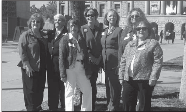
NFDW attendees from New Mexico, California and Arizona attended the Arizona Women in Blue at the State Capitol.