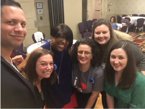
At North Carolina Convention Sept 2017

The DWNC Executive Board agreed at our DWNC Executive Board meeting to collaborate with the ERA-NC Alliance during the HKonJ (Historic Thousands on Jones Street) - 2018 Moral March. The ERA-NC Alliance will be sponsoring an opportunity for all of their LEAD ORGANIZATIONS to march together displaying their respective organization's banner or signs.