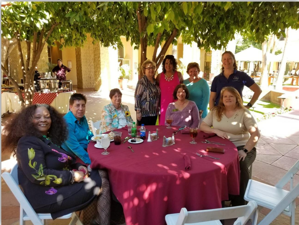
NFDW leadership at the Tempe Mission Palms Resort, site of the 2018 NFDW Convention