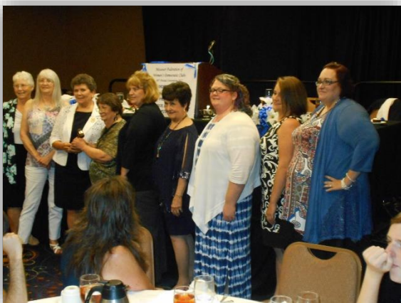
Missouri Federation of Women's Democratic Club officers