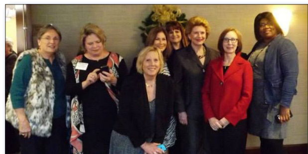
Some of our board members with Senator Stabenow.