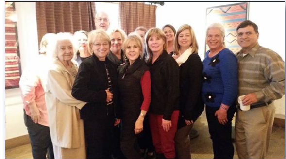
Valencia County, NM