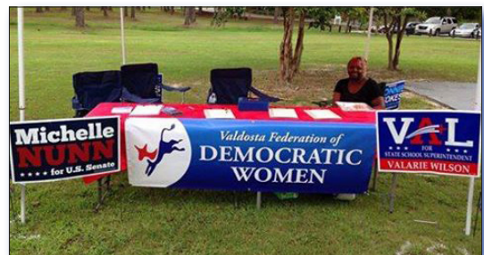
Valdosta Federation of Democratic Women

The Georgia General Assembly went into session on January 11th and the Republican dominated chambers didn't waste any time in introducing legislation that, if passed, will be detrimental to our state. Our members are working to prevent our governor's request to cut health care insurance for school bus drivers and cafeteria workers from passing the state budget process. Likewise, we are fighting to prevent a loss of early voting days. The Georgia Legislature will be in session for 40 days and will like end around mid-March, so GFDW will stay focused.