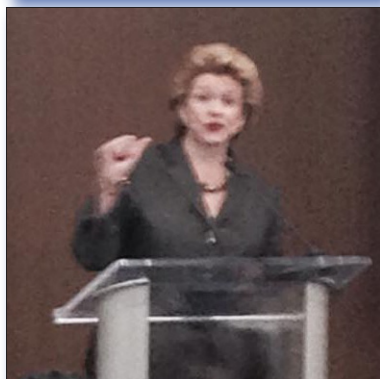
US Senator from Michigan, Debbie Stabenow