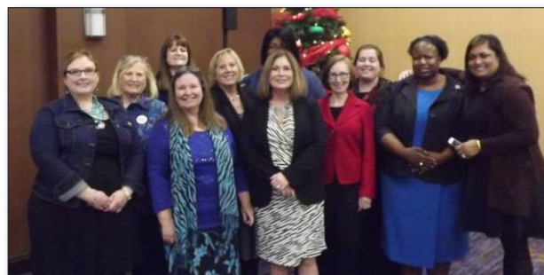
After our elections...