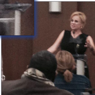
Tennessee state Senator, Sara Kyle, revs up the crowd.