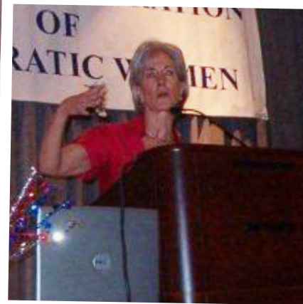
Honorable Kathleen Sebelius