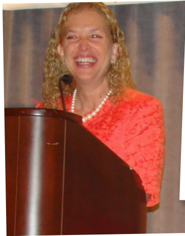
DNC Chair Debbie Wasserman Schultz