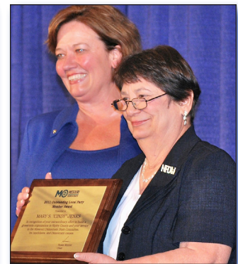
Receiving the first Outstanding Local Party Member award.