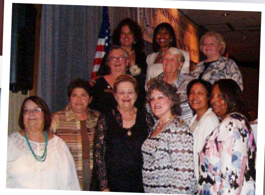
New NFDW Officers installed