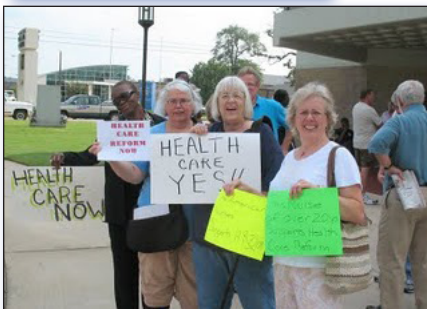
GFDW members rally for the Affordable Health Care Act